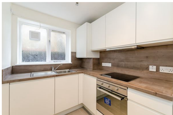
The Limes Avenue, New Southgate, N11

London N11 1RF 323.00 sqft 30.01 sqm available from now on