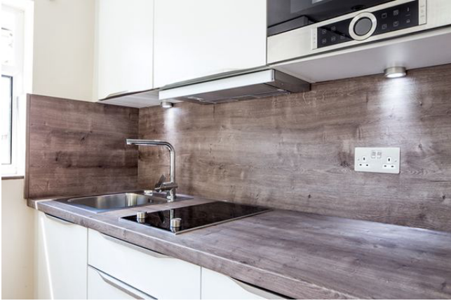
Flat 6, 18 Belmont Road, Upper Ground-Floor, Turnpike Lane, 3LT N15 13,00 sq. m. 161,00 sq. ft.

London N15 3LT floor 1 out of 1 bathrooms 1 161.00 sqft 14.96 sqm available from 13/03/2025