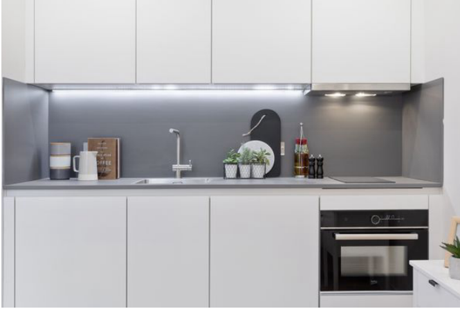
Ground floor, Kingscroft House 27, Cedar Road, London, SM2 5LF 23.40 sq. m 251.87.55 sq. ft

London SM2 5FL floor 1 out of 1 bathrooms 1 251.00 sqft 23.32 sqm available from 08/11/2024