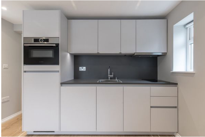
Flat 2, 117, Uxbridge Road, London, TW12, 1SL

London TW12 1SL 172.00 sqft 15.98 sqm available from now on