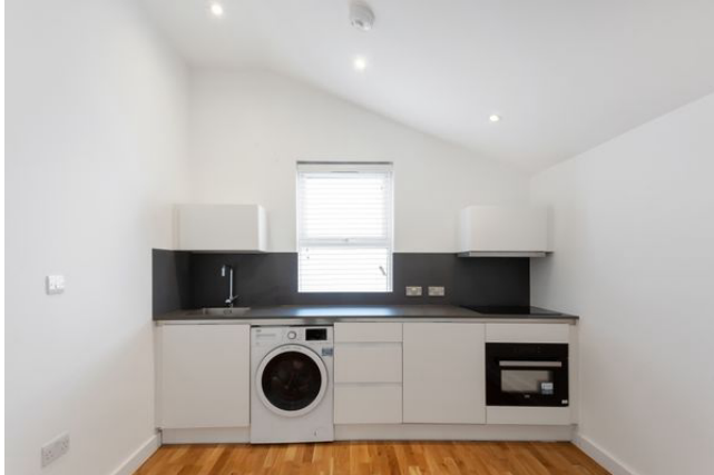
Flat 3, first floor, 53 Grosvenor Road, London, W7, 1HR 16,50 sq. m

London W7 1HR floor 1 out of 2 bathrooms 1 178.00 sqft 16.54 sqm available from now on