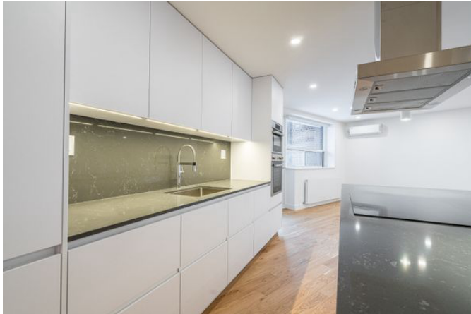
36 Castle Frank Road