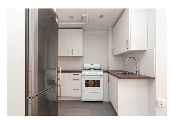
available from now on total rent CAD 1,500 one-year lease