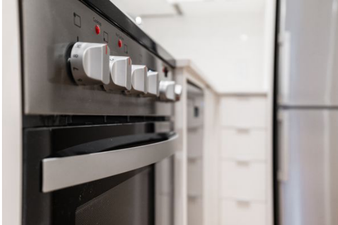
160 Huron Street

Toronto, ON, M5T 2B5 floor 4 out of 6 bathrooms 1 226.00 sqft 21.00 sqm available from 2024-11-01