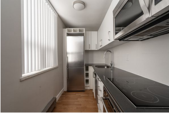
188 Jameson Avenue

Toronto, ON, M6K 2Z3 floor 6 out of 9 bathrooms 1 495.00 sqft 45.99 sqm available from 2024-12-05