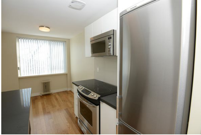
501 Kingston Road