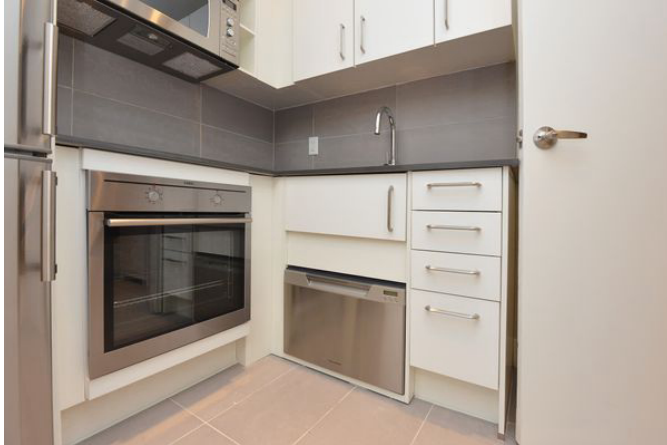
56 Maitland Street

Toronto, ON, M4Y 1C5 floor 2 out of 4 bathrooms 1 235.00 sqft 21.83 sqm available from 2025-01-06