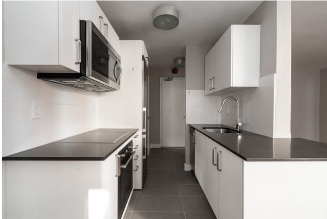
95 Jameson Ave

Toronto, ON, M6K 2X1 floor 3 out of 10 bedrooms 1 bathrooms 1 513.60 sqft 47.71 sqm available from 2025-01-07