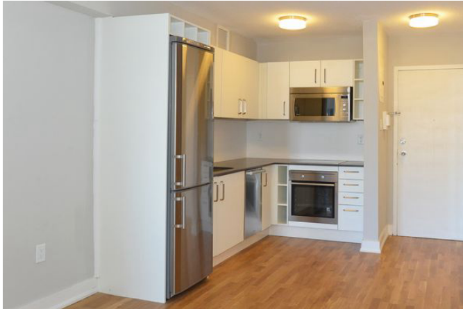
230 Oak Street