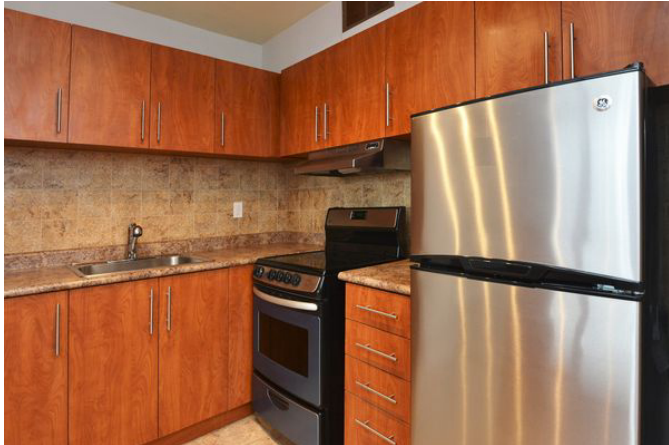
230 Oak Street

Toronto, ON, M5A 2E2 floor 12 out of 25 bedrooms 1 bathrooms 1 383.00 sqft 35.58 sqm available from now on