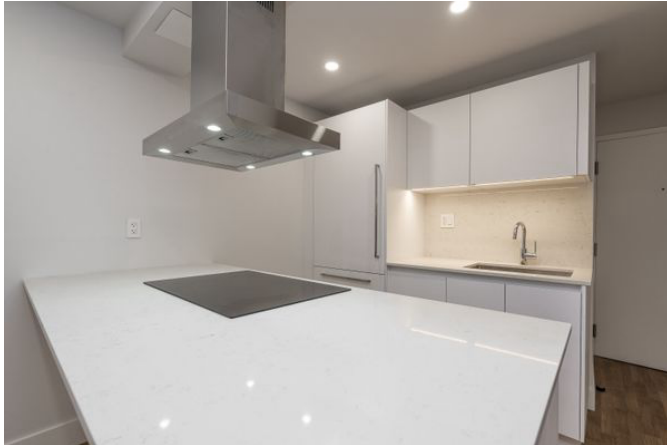
230 Oak Street