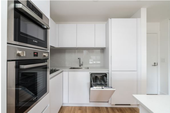
230 Oak Street