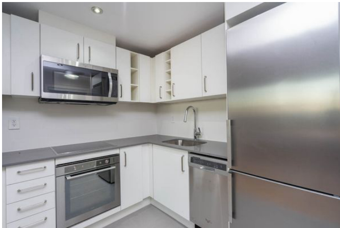
230 Oak Street