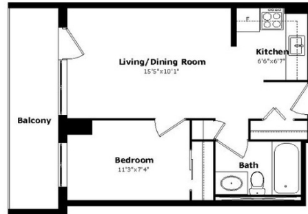
SUITE 09 (2nd-23th Floor) Approx. Floor Area: 383.3 sq.ft.