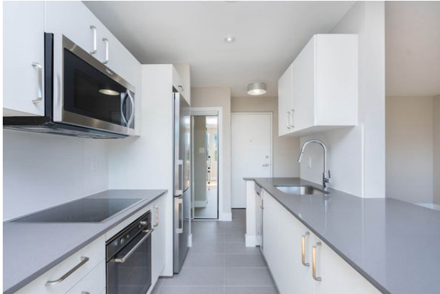
25 Eccleston Drive