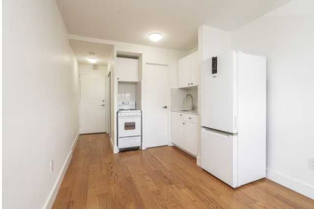
730 St Clarens Avenue