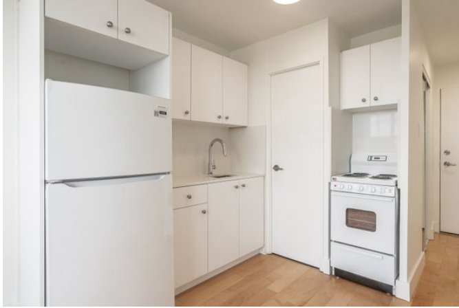
730 St Clarens Avenue

Toronto, ON, M6H 4E8 floor 10 out of 19 bathrooms 1 230.00 sqft 21.37 sqm available from now on