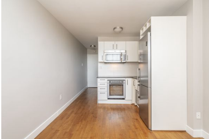
730 St Clarens Avenue

Toronto, ON, M6H 4E8 floor 12 out of 19 bathrooms 1 230.00 sqft 21.37 sqm available from now on