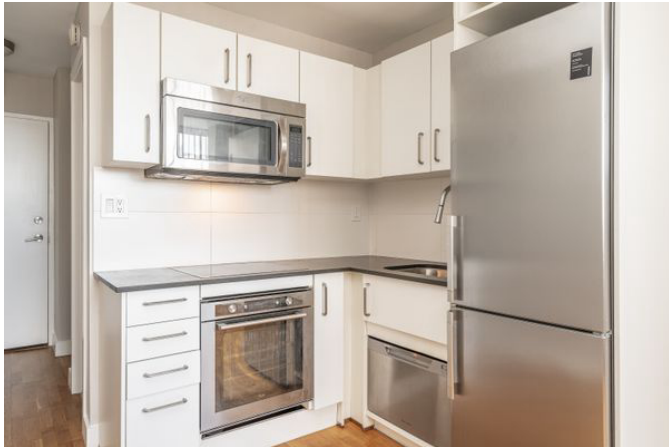
730 St Clarens Avenue

Toronto, ON, M6H 4E8 floor 15 out of 19 bathrooms 1 230.00 sqft 21.37 sqm available from now on