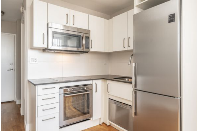
730 St Clarens Avenue

Toronto, ON, M6H 4E8 floor 13 out of 19 bathrooms 1 230.00 sqft 21.37 sqm available from now on