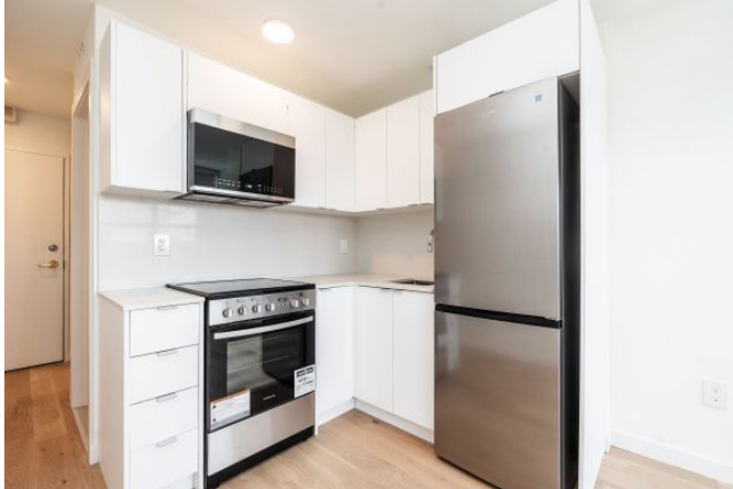
730 St Clarens Avenue