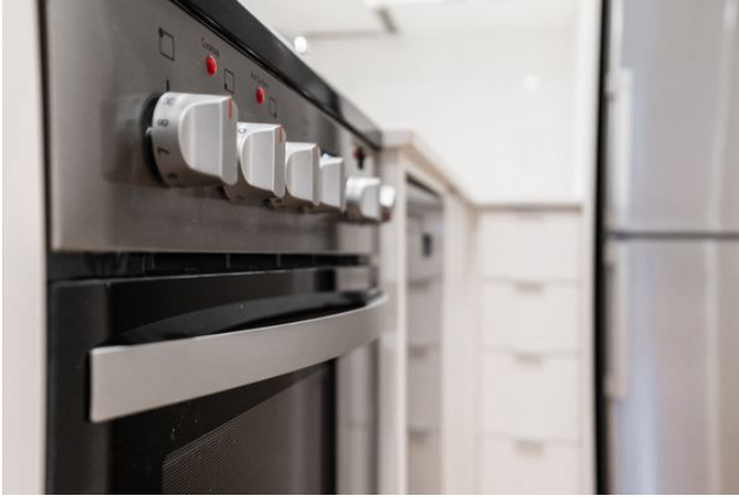
730 St Clarens Avenue

Toronto, ON, M6H 4E8 floor 15 out of 19 bathrooms 1 230.00 sqft 21.37 sqm available from 2025-02-01