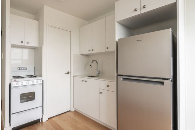
730 St Clarens Avenue