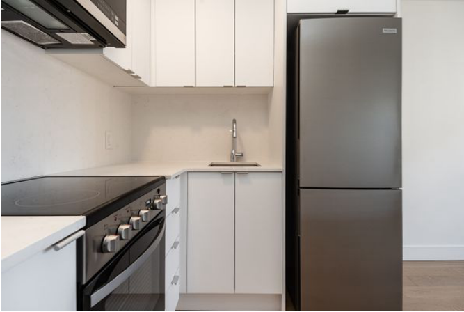
730 St Clarens Avenue

Toronto, ON, M6H 4E8 floor 14 out of 19 bathrooms 1 230.00 sqft 21.37 sqm available from now on