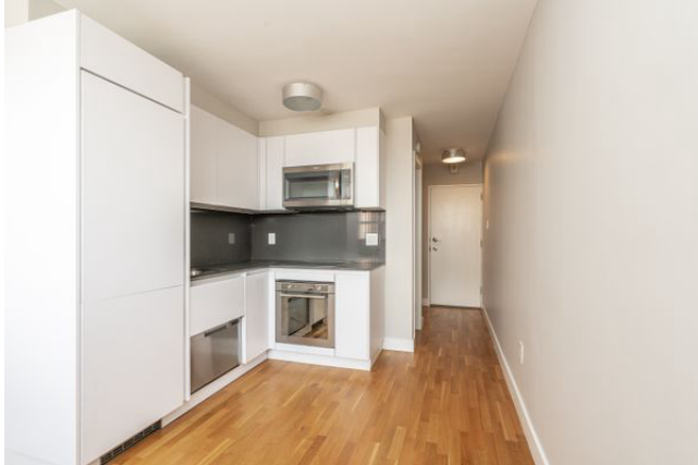
730 St Clarens Avenue

Toronto, ON, M6H 4E8 floor 5 out of 19 bathrooms 1 230.00 sqft 21.37 sqm available from 2025-08-01