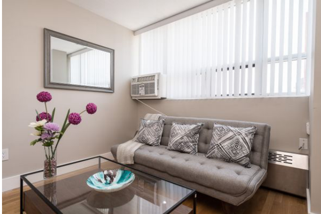
730 St Clarens Avenue