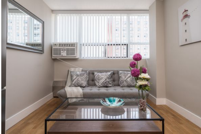
730 St Clarens Avenue

Toronto, ON, M6H 4E8 floor 6 out of 19 bathrooms 1 230.00 sqft 21.37 sqm available from 2026-03-07