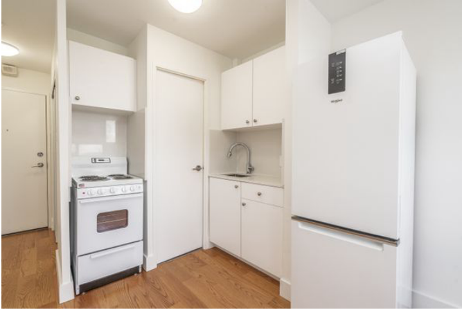
730 St Clarens Avenue

Toronto, ON, M6H 4E8 floor 6 out of 19 bathrooms 1 230.00 sqft 21.37 sqm available from 2024-11-15