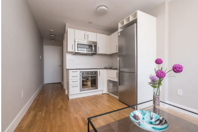
730 St Clarens Avenue

Toronto, ON, M6H 4E8 floor 7 out of 19 bathrooms 1 230.00 sqft 21.37 sqm available from 2024-11-11