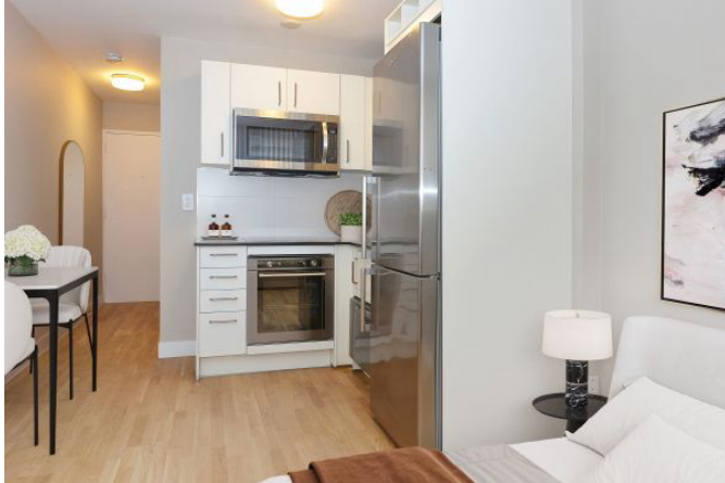
730 St Clarens Avenue

Toronto, ON, M6H 4E8 floor 8 out of 19 bathrooms 1 230.00 sqft 21.37 sqm available from now on