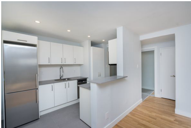
111 Lawton Boulevard