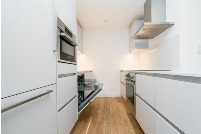
240 Oriole Parkway