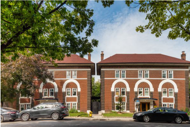
26 Balmoral Avenue