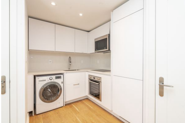
28 Balmoral Ave