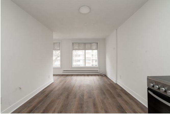
28 Maynard Avenue

Toronto, ON, M6K 2Z9 floor 3 out of 3 bathrooms 1 329.38 sqft 30.60 sqm available from 2024-05-06