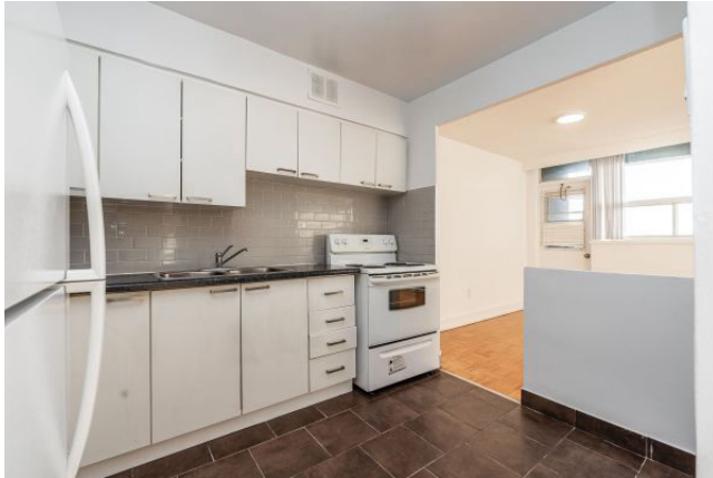
263 Dixon Road