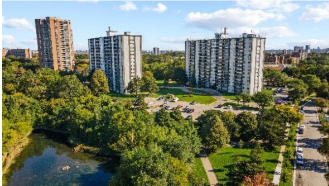
265 Dixon Road