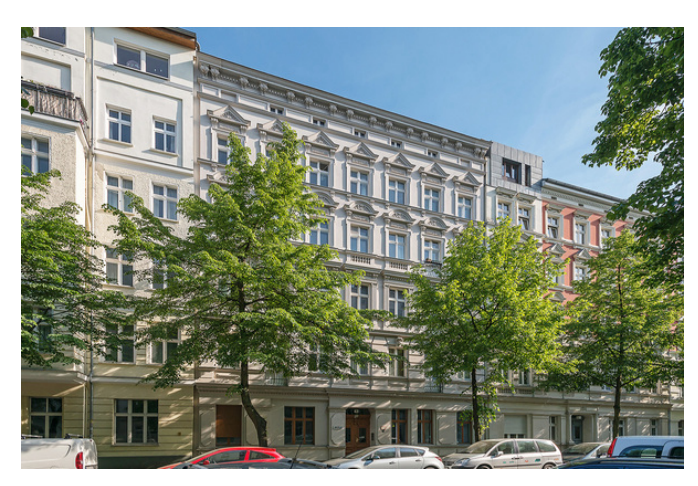
available from now on total rent EUR 965